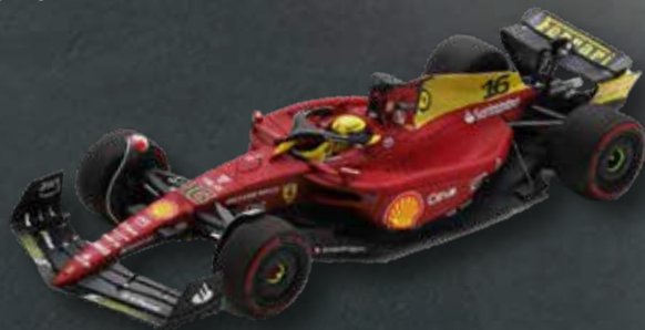
FERRARI SF23 2023