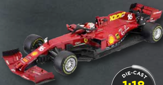
FERRARI SF-1000 2020