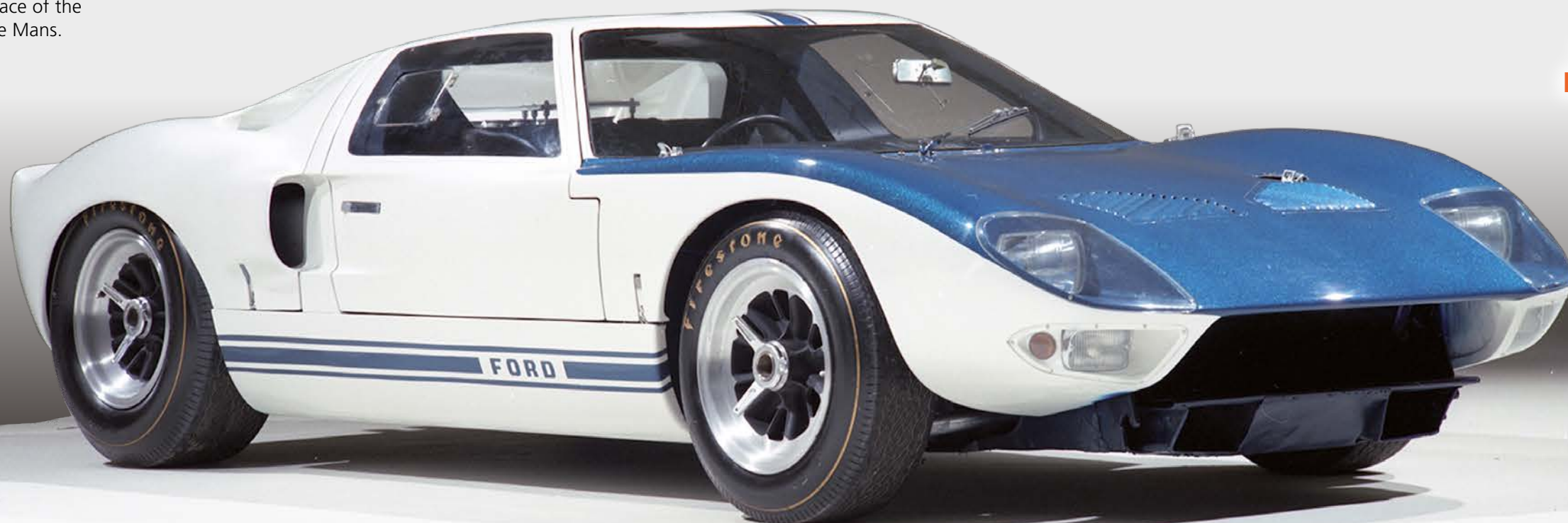
The first Ford GT in its definitive version.

Now you can build a faithful replica of the Ford GT, assembling this icon of speed on track step by step.