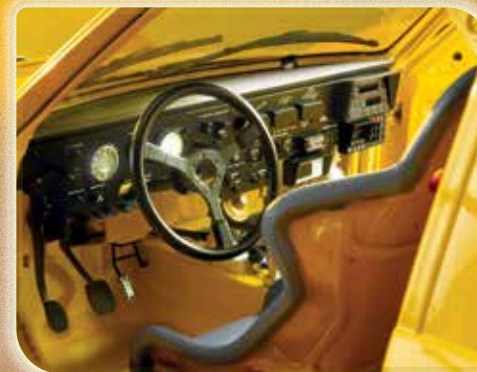
Dashboard reproduced to the last detail.