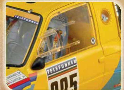
Adjustable windows, identical to the original.