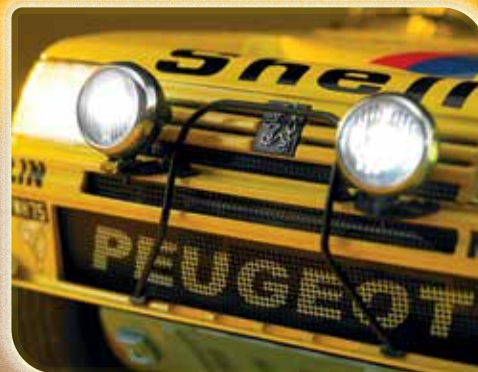
Functional head and taillights.