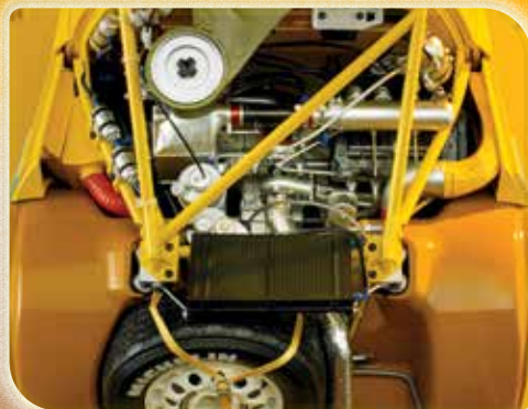
Spare wheel under the front hood.