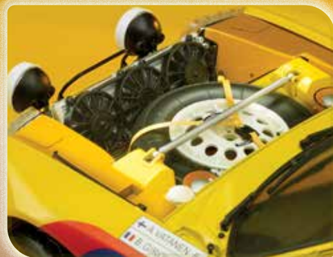
Faithful reproduction of all the details.

Every detail of the original model is faithfully reproduced in this model.